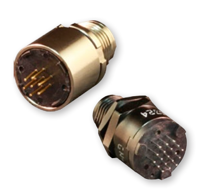
Rear-panel mount push-pull and threaded PCB receptacles now available

Glenair Series 88 SuperFly® represents a perfect storm of high-performance contacts, shells, wires, termination and mating technologies. SuperFly® is the only connector series in existence that combines the weight-saving and performance advantages of nanominiature, microminiature and AS39029 type (size #23) contacts in a precision package made to order for battlefield and other high-performance applications. Available in factory-terminated cordsets, single-ended pigtails, and discrete PCB termination receptacles for complete flexibility in cable and box configurations. SuperFly cordsets ship with ultra-flexible, highspeed GhostWire<sup>™</sup> cabling, your choice of threaded or quick disconnect coupling and a widerange of contact arrangements from 3-44 contacts. PCB receptacles are available in straight and right-angle configurations.