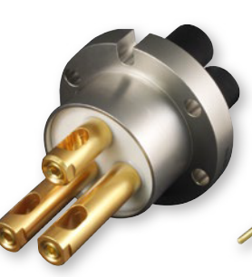
Hermetic power connector