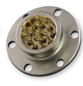
Single-way tool joint Hermetic probe hermetic connector connector

MIL-DTL-38999 QPL PIN AND SOCKET HERMETICS