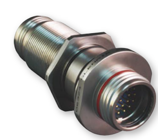
Hermetic bulkhead penetrator