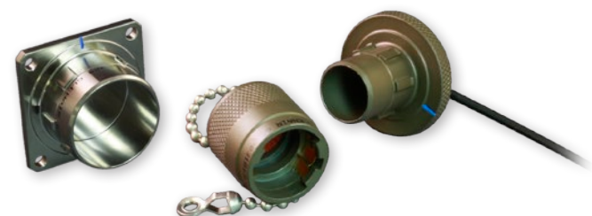
Glenair's complete Series IV solution includes protective covers and dummy stowage receptacles—available in all sizes, materials, and plating configurations.