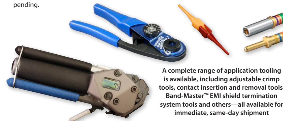
A complete range of application tooling is available, including adjustable crimp tools, contact insertion and removal tools, Band-Master™ EMI shield termination system tools and others—all available for immediate, same-day shipment