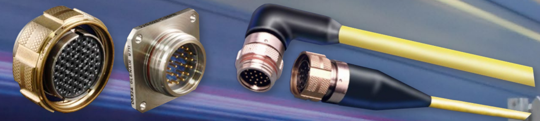
Series 22 Geo-Marine® High-Pressure Harsh-Environment Connectors and Cordsets

Glenair offers a “no gap” family of ruggedized power and signal interconnect solutions for industrial, rail, geophysical and power industry applications. No other interconnect manufacturer in the world supplies such a broad range of connectors, backshells, wire protection conduit, shrink boots, tools and more to meet harsh-environment industrial requirements. All our solutions are backed with our high availability customer service model, which includes in-stock inventory for thousands of critical part numbers, no dollar or quantity minimum orders, free samples upon request, free engineering and application development and more. Contact the factory or our industrial/rail product team for application engineering assistance.