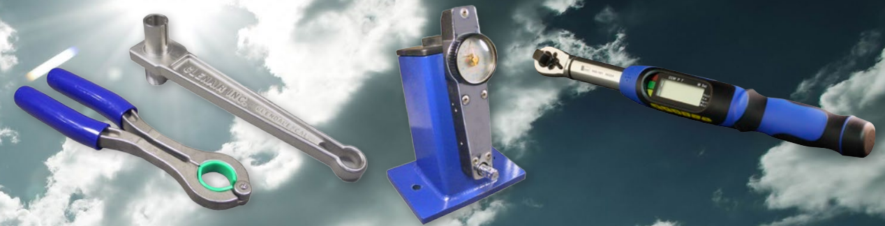
Backshell-to-Connector Assembly Tools