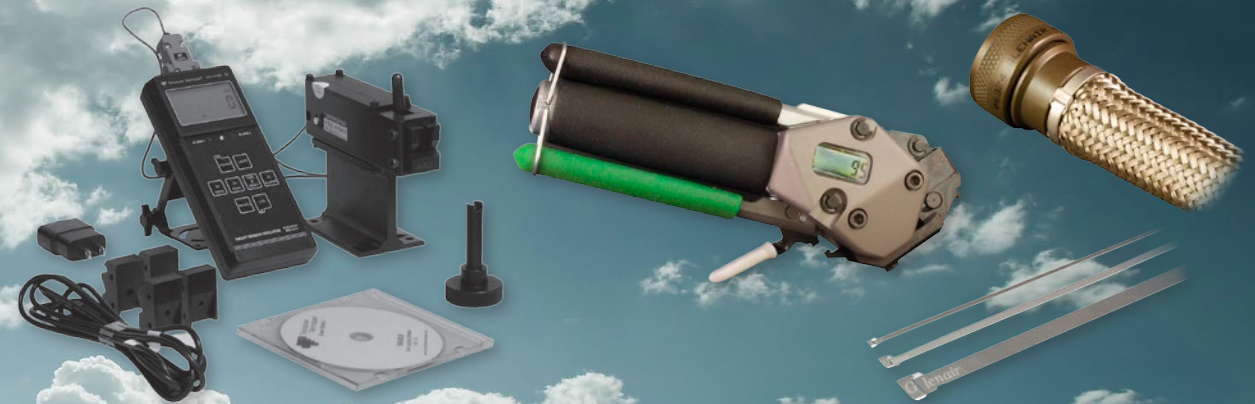
BandMaster™ ATS EMI/RFI Shield Termination System