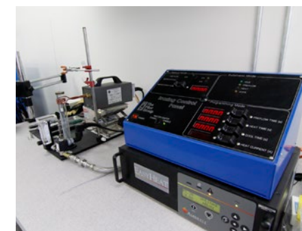
Brazing control panel

Solutions built to exact customer requirements and specifications