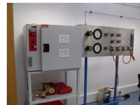
Pure air compatibility test equipment