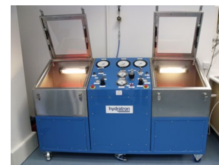
Pressure test rig