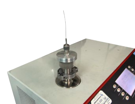
Gas tube helium leak test equipment