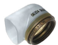
Potting Boot Page 68-9