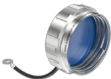
Protective Cover Page 66-1