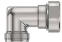
LFMC Conduit Backshell Page 42-1