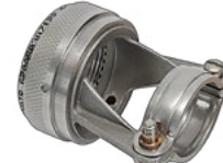
Saddle Clamp Page 62-1