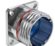
Dummy Receptacle Page 65-1