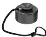
Rubber Cover Page 78-1