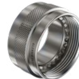
Grommet Nut Page 68-6