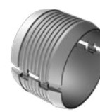
Splice Ring Page 68-5