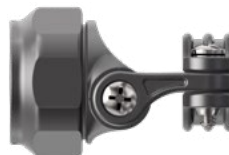
SwingArm® Clamp Page 87-1