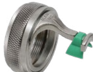
Qwik-Ty® Page 45-1