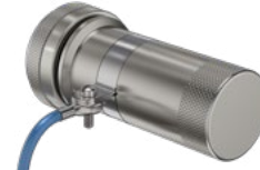
Shorting Cap Backshell Page 34-1