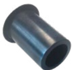
Telescoping Bushing Page 68-8