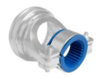
Bushing Strip Page 68-7