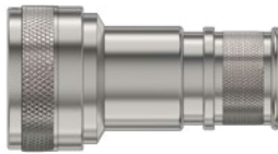
Banding Backshell Page 44-1