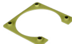
Nut Plate Page 48-1