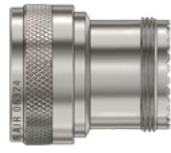
Extender Backshell Page 32-1