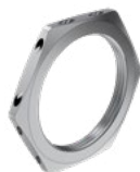
Jam Nut Page 68-1