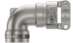
Strain Relief Backshell Page 36-1