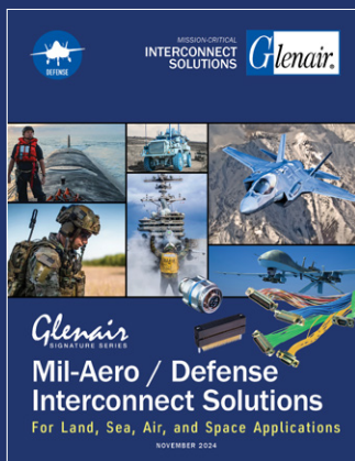
Full-spectrum, "no gap" product lines