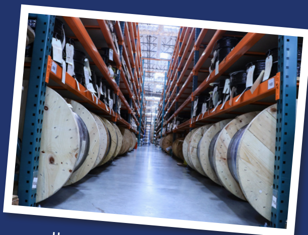
Huge same-day shipment inventory