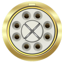
El Ochito® White for 10GBASE-T Ethernet, pin contact mating face

Lower installed cost. 100% tested. Save assembly time and cost with pre-wired El Ochito® White assemblies. These pin-to-socket cables have El Ochito® White contacts terminated to Category 6A aerospace-grade shielded cable. Supplied with cable sealing boot if applicable. These pre-wired El Ochito® contacts snap into connector body without requiring an insertion tool. Remove contacts with plastic tool 859-049. Compatible with Glenair Series 23, Series 80, Series 28, Series 792, ARINC 600 and EPXB connectors. Designed to meet the requirements of MIL-DTL-38999, SAE AS39029. El Ochito® contacts must be installed in keyed connectors before mating to prevent misalignment and contact damage.