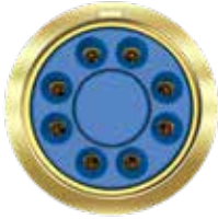
El Ochito ® Blue for SuperSpeed USB, pin contact mating face