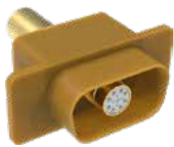
Pin Contact Adapter