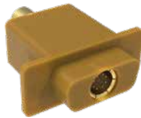
Socket Contact Adapter

Test your system or cable while preventing damage to expensive cables with El Ochito® test adapters. These test adapters properly align test contacts without the added expense and time-consuming labor of mating connectors. Insert adapter cable into adapter then push test adapter into Device Under Test (DUT).