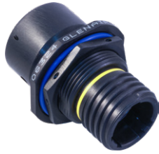
Receptacle without backshell