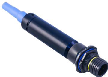
Receptacle with straight backshell