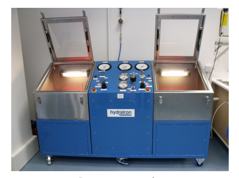
Pressure test rig