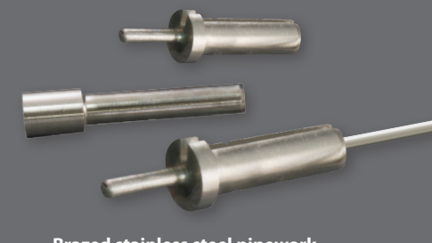
Brazed stainless steel pipework

Glenair pure gas/nitrogen systems and sub-assemblies provide passage of nitrogen and other pure, pressurized gases through precision-machined components such as pressure regulating valves, solenoids, and Joule-Thompson cryogenic cooling systems. Assemblies feature precision stainless steel pipeworks and tubing which are fabricated using a flux-free brazing process and are ultrasonically cleaned and packaged in a sealed, dust-free environment. Electromechanical components are also precision-machined with material properties and dimensional attributes per customer specifications.