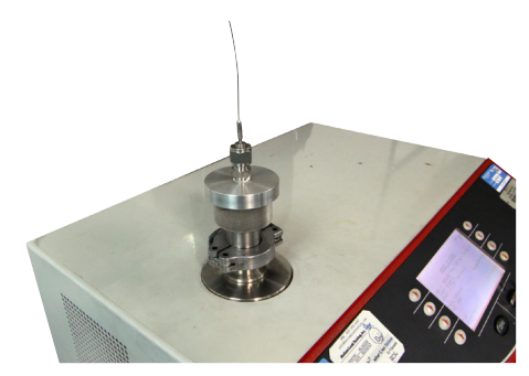
Gas tube helium leak test equipment