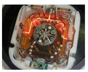
Ring Laser Gyroscopes