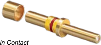
#16 Pin Contact