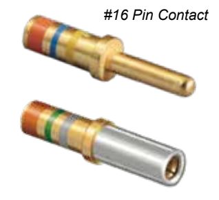
#16 Socket Contact