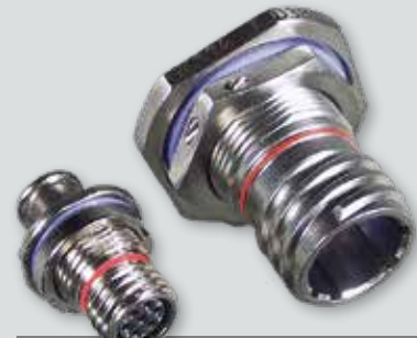
Mighty Mouse vs. 38999: Half the Size and Weight

Glenair developed the Series 80 Mighty Mouse over twenty-five years ago as a smaller and lighter version of D38999. Our goal was to radically reduce the size and weight of this flightcritical connector while maintaining its core performance features. Our miniaturization work took place in three key areas beginning with reduction