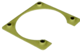
2 3/4 perimeter nut plate for installation on pre-wired assemblies. Shown with epoxy primer coating.

Nut plates speed up connector installation and eliminate dropped hardware in hard-to-reach locations. For use with Series 806 square flange panel mount connectors. Two styles: full perimeter and 3/4 perimeter. Install full perimeter plate over wires before terminating the connector. 3/4 perimeter version can be installed on wired connectors. Aluminum plate with self-locking stainless steel female clinch nuts. Plate is coated with chem film per MIL-DTL-5541 Class 1A, or, for maximum corrosion protection choose epoxy primer coating.