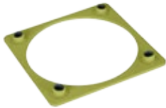
1 Full perimeter nut plate. Assemble over wires before connector termination. Shown with epoxy primer coating.