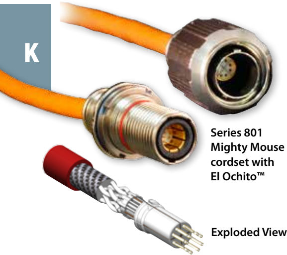
Series 801 Mighty Mouse cordset with EI Ochito™