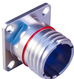
Box Mount Receptacle