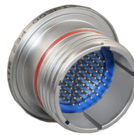
Weld Mount Receptacle