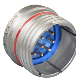
Solder Mount Receptacle