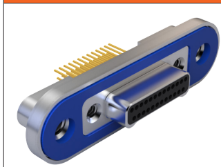
T - Female Thread