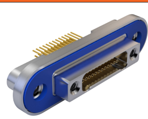
T - Female Thread