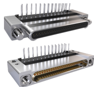
MIL-DTL-32139/07 and /08 Plug and Receptacle, Single Row, Right-Angle Mount Thru-Hole PCB Connectors