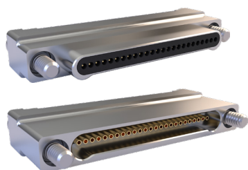
MIL-DTL-32139/05 and /06 Plug and Receptacle, Single Row, Vertical Mount, Thru-Hole PCB Connectors