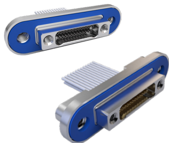
MIL-DTL-32139/09 and /10 Plug and Receptacle, Rear Panel Mount, Dual Row Connectors with Insulated Wire