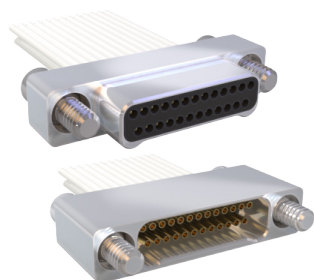
MIL-DTL-32139/03 and /04 Plug and Receptacle, Dual Row Connectors with Insulated Wire