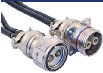
SuperNine Series III and I Overview Page 8