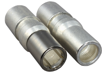
Figure 2 Conventional Contact on the Left, LouverBand Contact on the Right