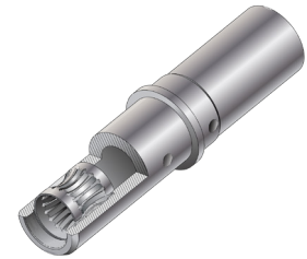
Figure 1 LouverBand Socket Contact