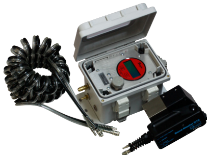
High Volume Pneumatic Tool