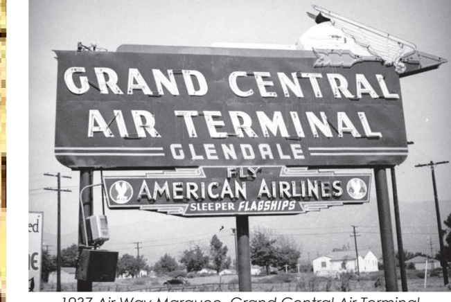
1937 Air Way Marquee, Grand Central Air Termina