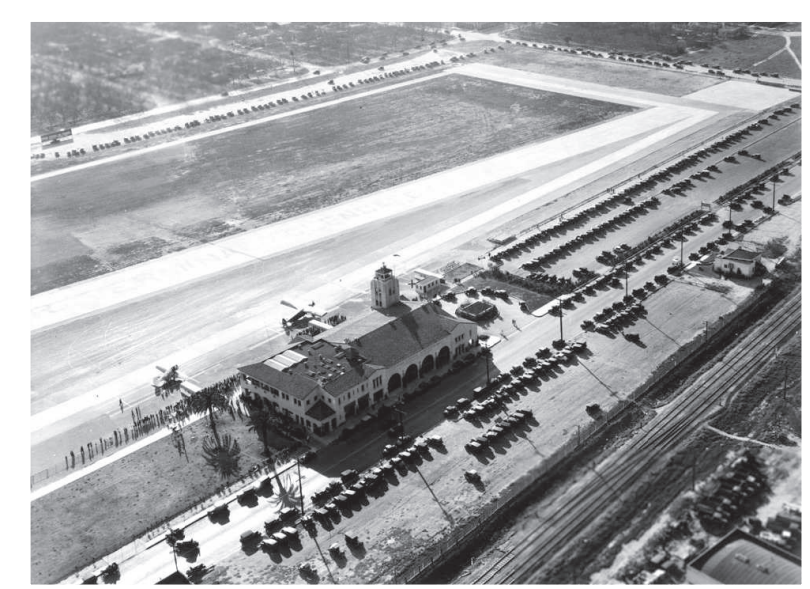
932 Aerial View, Grand Central Air Terminal