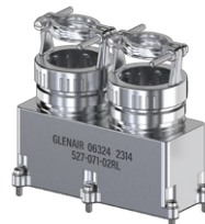
EMI TAG Ring® 527-071 Page D-9