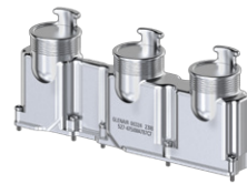
EMI Banding Composite 527-475 Page D-6