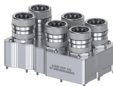
EMI TAG Ring® 527-199 Page D-12