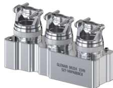
Strain Relief 527-149 Page D-7