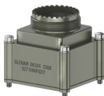
M25, M28 Threads 527-114 Page D-14