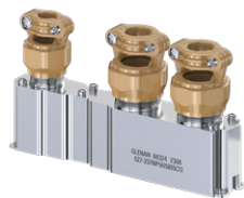
Strain Relief + Braid Socket 527-257 Page D-3