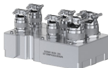
Strain Relief 527-126 Page D-11