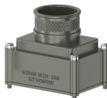
EMI Banding 527-543 Page D-15