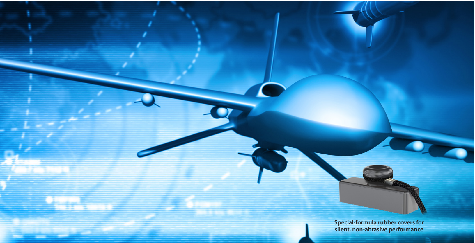
Special-formula rubber covers for silent, non-abrasive performance

M83513 Micro-D connector backshells and accessories— the world's most complete selection, all with available same-day delivery