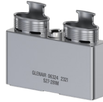
EMI Banding Backshell 1.5" (38.1) Can Height BACC65AA/AB, EPXB2 527-281 Page E-4