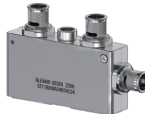
EMI Banding Backshell 1.56" (39.6) Can Height EPXB2 527-268 Page E-7