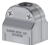
Clampshell, Single Module EN4165, BACC65BU/CA 527-407 Page E-12