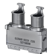
EMI Banding Backshell Snap-Together Composite SIM AD 6 Two Module 527-586 Page E-11