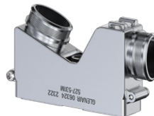
EMI Banding Backshell End Entry EPXB2 527-531 Page E-8