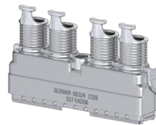
EMI Banding Backshell Snap-Together Composite SIM AD 6 Four Module 527-542 Page E-10