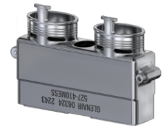
EMI Banding Backshell 1.0" (38.1) Can Height BACC65AA/AB, EPXB2 527-410 Page E-5