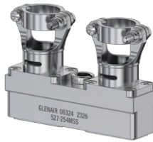
EMI Banding Backshell with Saddle Clamps BACC65AA/AB, EPXB2 527-254 Page E-6