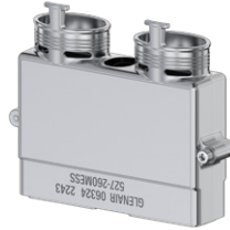
EMI Banding Backshell 2" (50.8) Can Height BACC65AA/AB, EPXB2 527-260 Page E-2