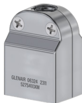
Clampshell, Single Extended Length Module EN4165, BACC65BU/CA 527-493 Page E-13