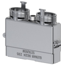
EMI Banding Backshell 2" Can (50.8) Height BACC65AA/AB, EPXB2, Radiall 617610100 527-265 Page E-3