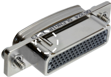
Plug connector with key at position A