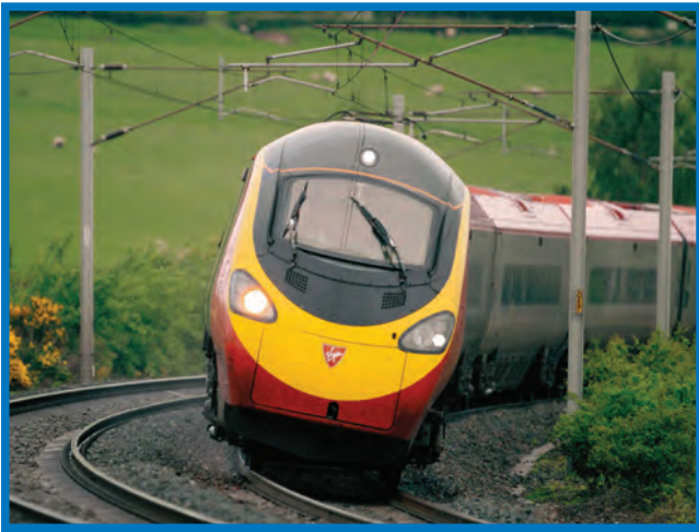
Pendolino (from the Italian Pendolo) is an Italian family of tilting trains manufactured by Fiat Ferroviaria

First developed and manufactured by Fiat, but taken over by Alstom in 2002, Pendolino is an Italian tilting train system used throughout Europe and in China. The tilt technology is contained in the bogie (swivel truck). When going into curves, sensors on the leading car