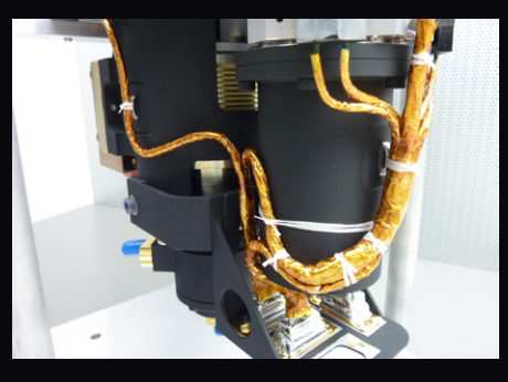
Harness integration into space payload electromechanical devices