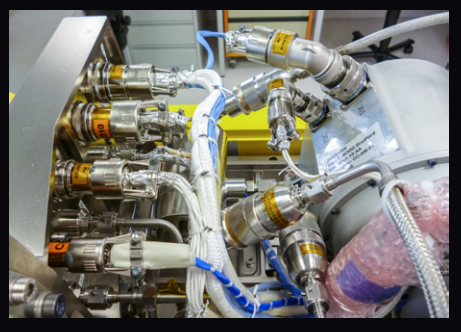
EMI shielded and open-wire bundle assemblies ready for flight