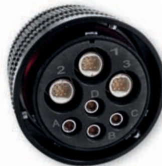
36-OB7 3 OCTOBYTE 4 SIZE 8 CONTACTS