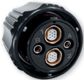
28-OB4 2 OCTOBYTE 2 SIZE 8 CONTACTS