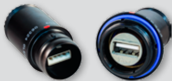
NEW: SuperSeal™ Series 801, 804 and 805 Mighty Mouse Standard USB 2.0 Connectors