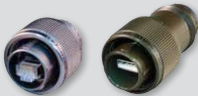
NEW: SuperSeal™ MIL-DTL-28840 Type RJ12/RJ45 and USB Shipboard Connectors