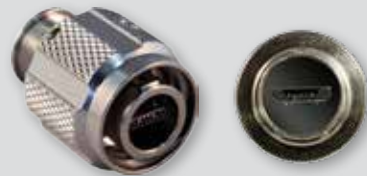
SuperSeal™ Series 801, 804 and 805 Mighty Mouse Micro USB 2.0 Connectors