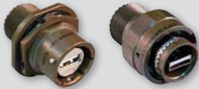
NEW: IPT SuperSeal™ MIL-DTL-26482 Type Bayonet USB Connectors