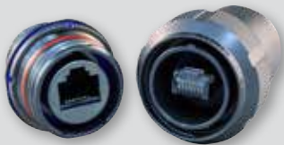
NEW: SuperSeal™ Series 801, 804 and 805 Mighty Mouse RJ45 Connectors