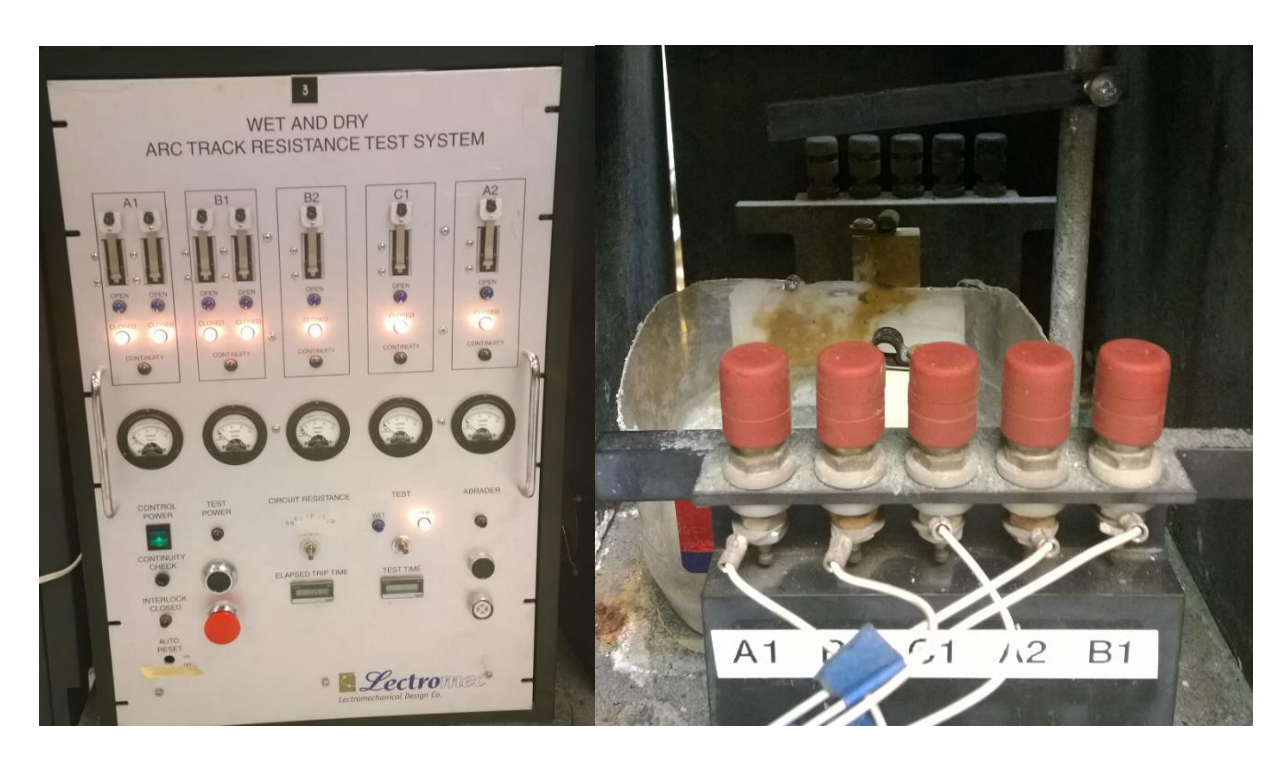
Figure 1: Lectromec wet arc track resistance test equipment control cabinet [left] and wet arc resistance test stand [right].