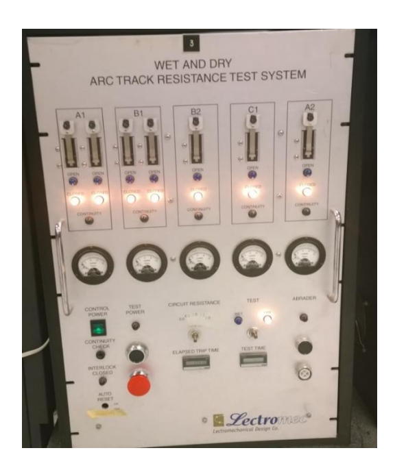
Figure 1: Lectromec wet short circuit test equipment control cabinet. Circuit C2 runs in a circuit in parallel with the control cabinet.