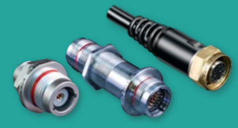
AquaMouse™ 3500 PSI miniature connectors and overmolded cables