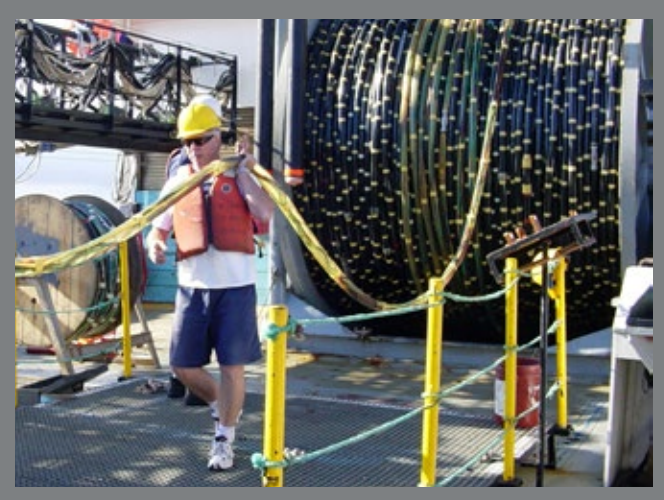
Power and data interconnects for towed-array streamers