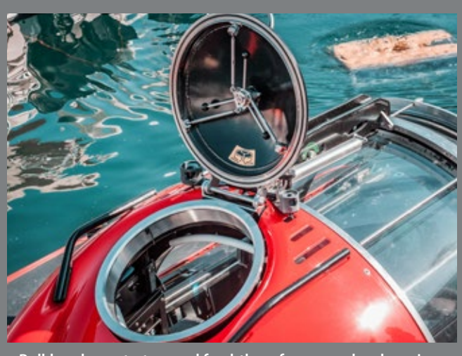
Bulkhead penetrators and feed-thrus for research submarines